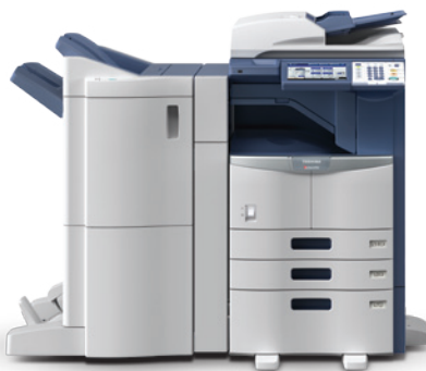
e-STUDIO456 with 2,000-Sheet LCF, Hole Punch, and Saddle-Stitch Finisher.