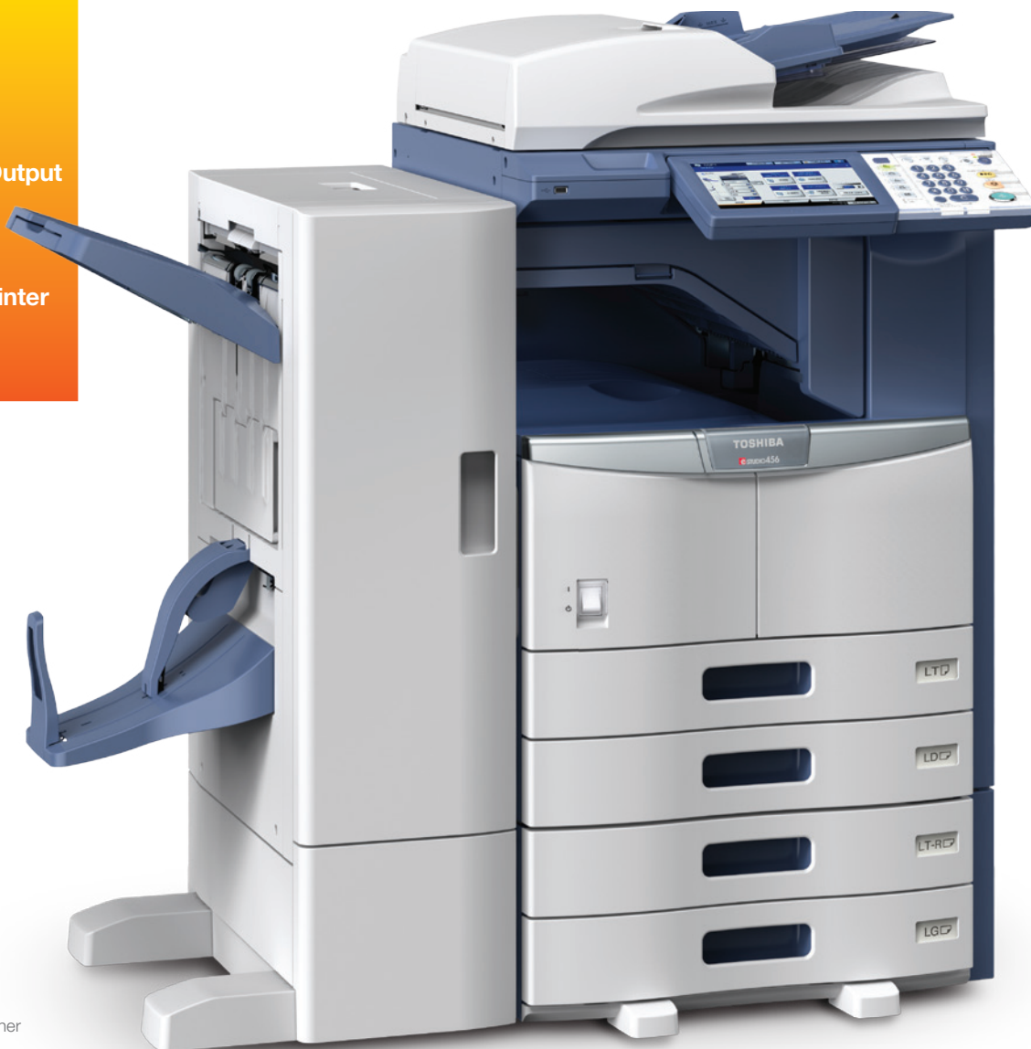
e-STUDIO456 with Saddle-Stitch Finisher